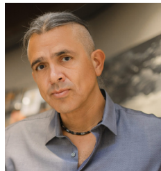
Stephen Graham Jones